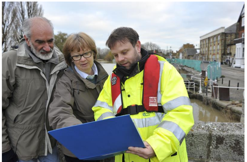
Talking to residents during the December 2013 east coast tidal surge

“As a Strand Street, Sandwich resident I wish to thank you for all the work that prevented my home from being flooded during the recent surge. [...] Well done all.” – Local resident