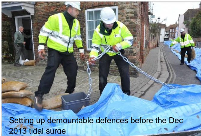
Setting up demountable defences before the Dec 2013 tidal surge

The biggest tidal surge in 60 years hit the east coast on Friday 6 December 2013. Our teams were in the town on Thursday night and Friday day to monitor and respond to the tidal surge. Our contractors, Jackson Civil Engineering, did a brilliant job providing local residents with over 7,000 sandbags. We also put additional demountable defences on Strand Street which worked in combination with the partially constructed flood alleviation scheme to further reduce the impact of the storm on the town.