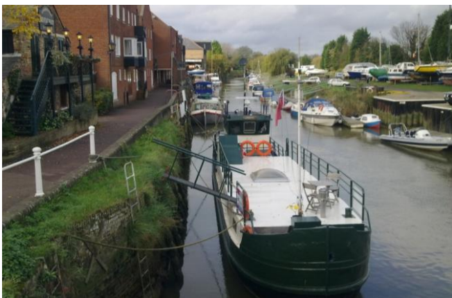
Left: Aynsley Court, Sandwich: Before our tidal defence works.