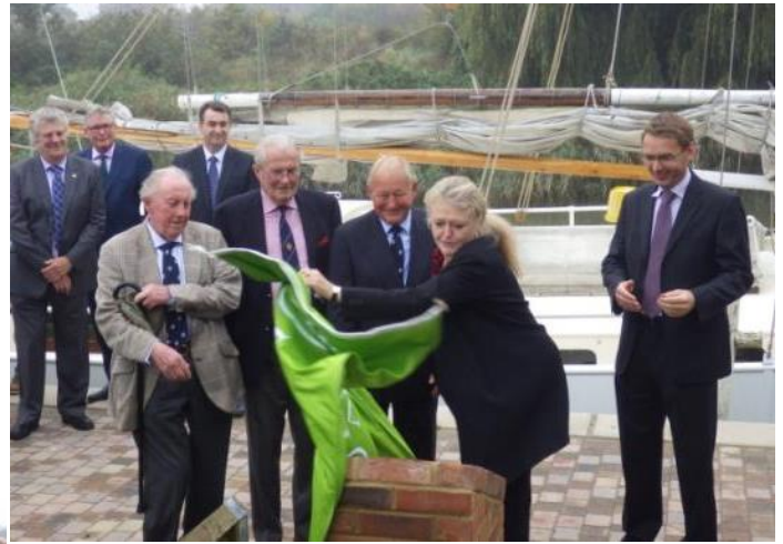
Quay Opening Ceremony: Representatives from Environment Agency, Kent County Council, Pfizer, Councillors and Sandwich Port and Haven Commissioners

During our works we discovered a large anchor under the Quay, this was refurbished and was unveiled with a plaque as part of the opening ceremony by the local MP Laura Sandys.