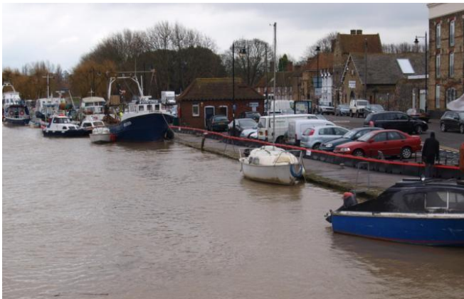
Left: Sandwich Quay: Before our tidal defence works. Our demountable defences used during high tides.