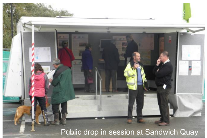
Public drop in session at Sandwich Quay

We kept the local community updated on our progress through regular newsletters, drop in sessions, press releases and web and social media updates.