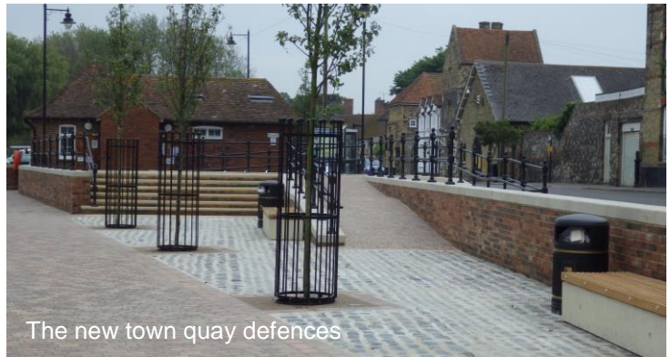
The new town quay defences

The wall at Sandwich Quay was a key consideration during the design phase because access and views are important to local people but the wall needs to provide a 1 in 200 level of protection. We worked closely with Dover District Council and Sandwich Town Council to make sure the design of the wall provides as much access as possible and that the finish is in keeping with the nearby buildings and local setting.