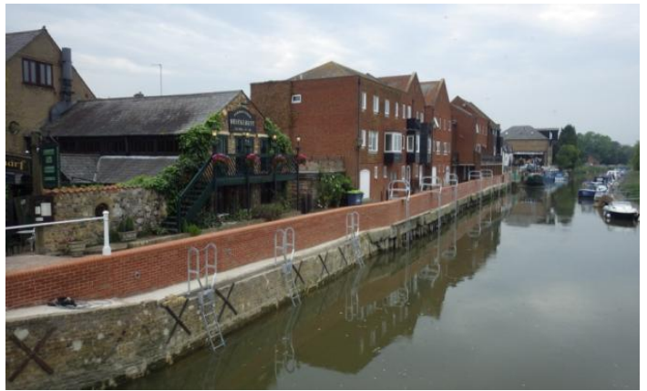
Right: Aynsley Court, Sandwich: After our tidal defence works.