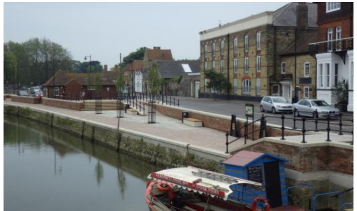
Right: Sandwich Quay: After our tidal defence works, our demountable defences no longer required.